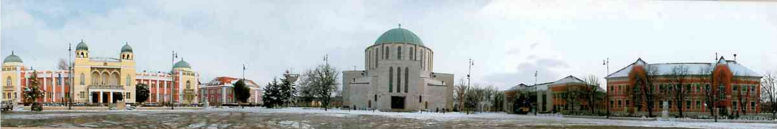
Széchenyi Square, the main square of the town (panorama photo)