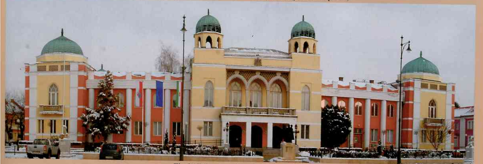
The building complex of the Town Hall